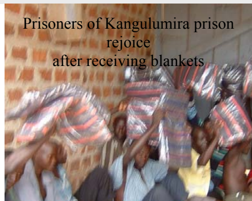
Prisoners of Kangulumira prison rejoice after receiving blankets