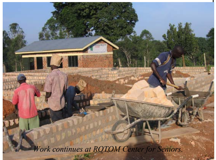
Work continues at ROTOM Center for Seniors.