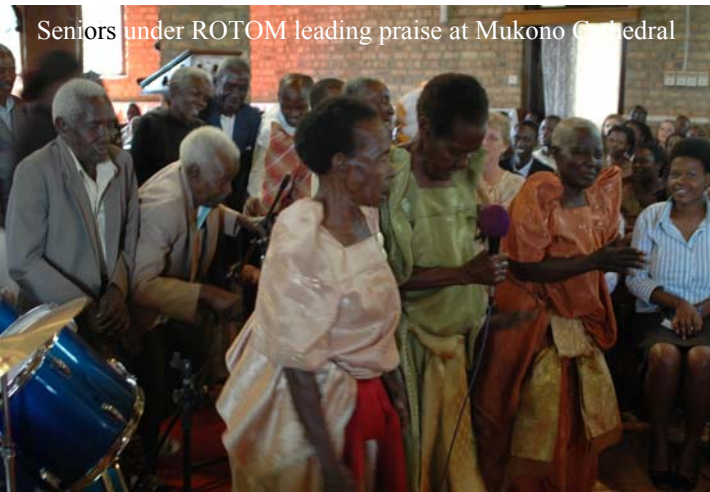
Seniors under ROTOM leading praise at Mukono Cathedral

Interestingly, these seniors are not out asking for pity or begging. (remember, all the seniors under ROTOM are selected because they are poor). Instead they teach and tell the young how to live responsible and God-pleasing lives, sharing the secrets that have helped them live so long.