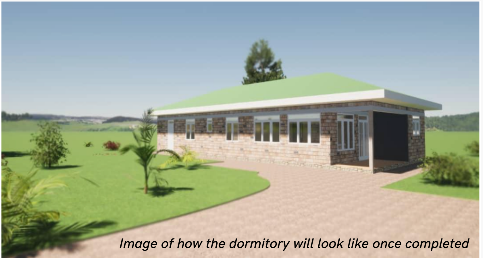
Image of how the dormitory will look like once completed

Support the ROTOM School Dormitory Suggested Amount- $25 (108)