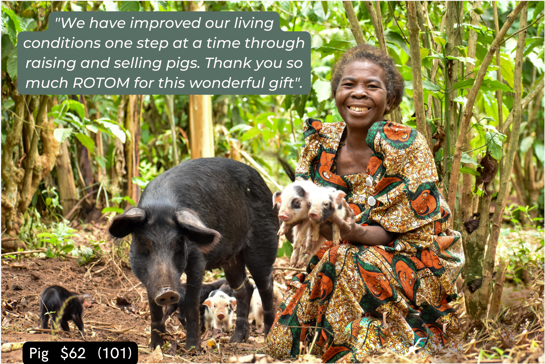
Pig $62 (101)

"We have improved our living conditions one step at a time through raising and selling pigs. Thank you so much ROTOM for this wonderful gift".