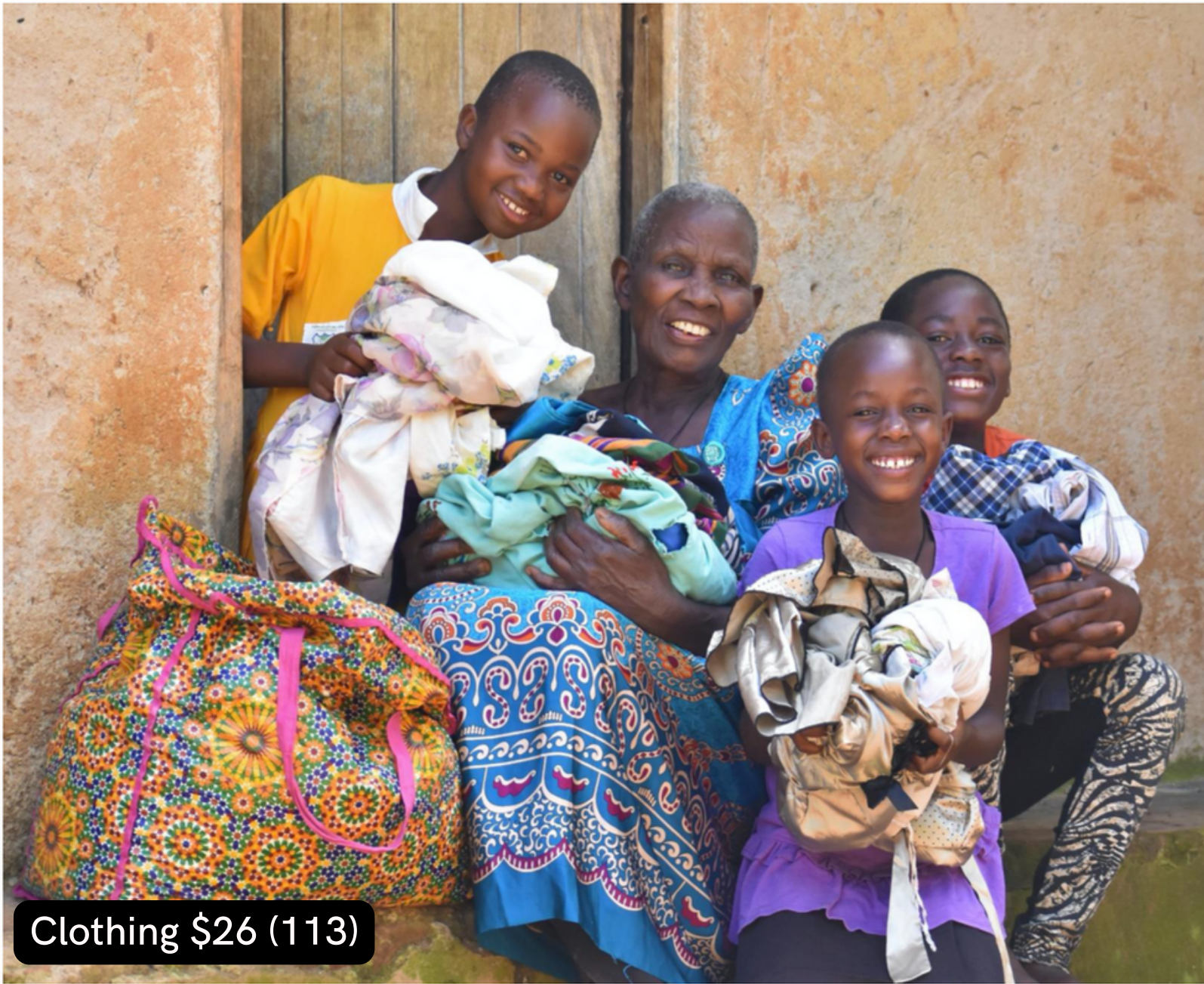
Clothing $26 (113)