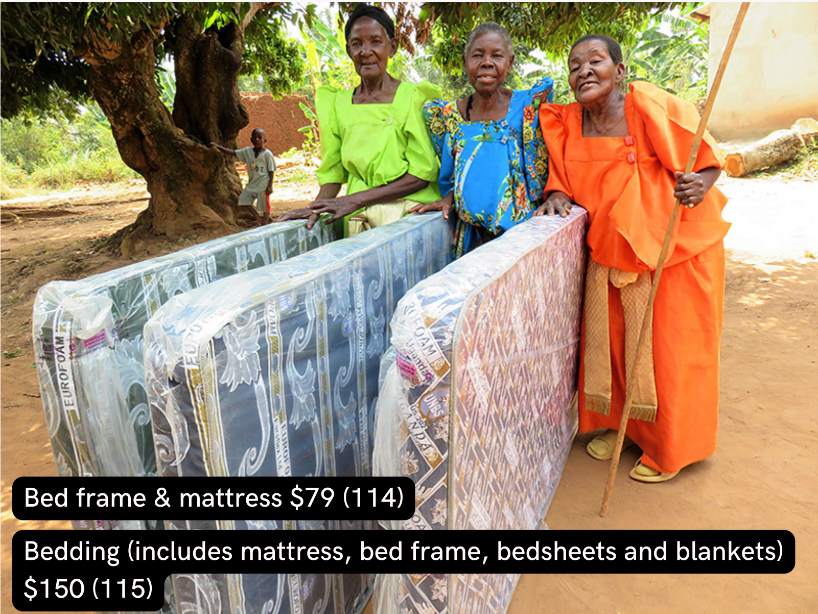
Bed frame & mattress $79 (114)