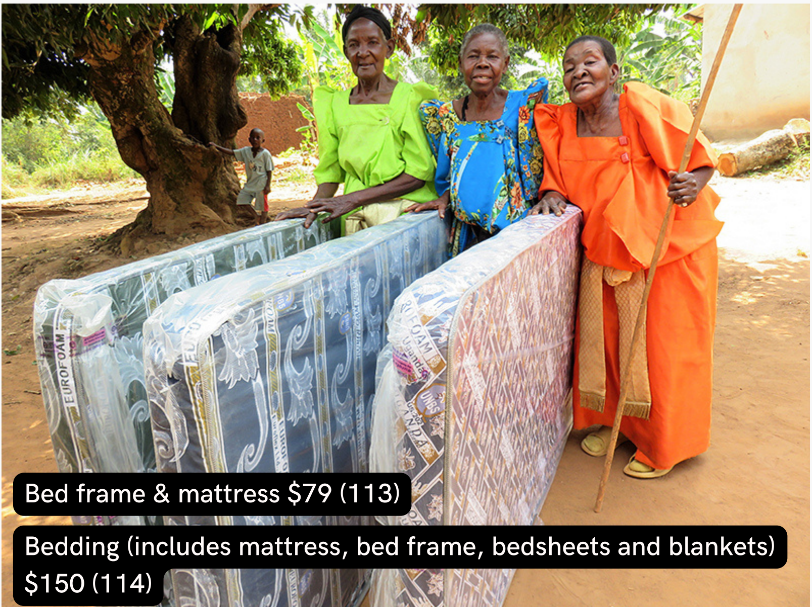
Bed frame & mattress $79 (113)