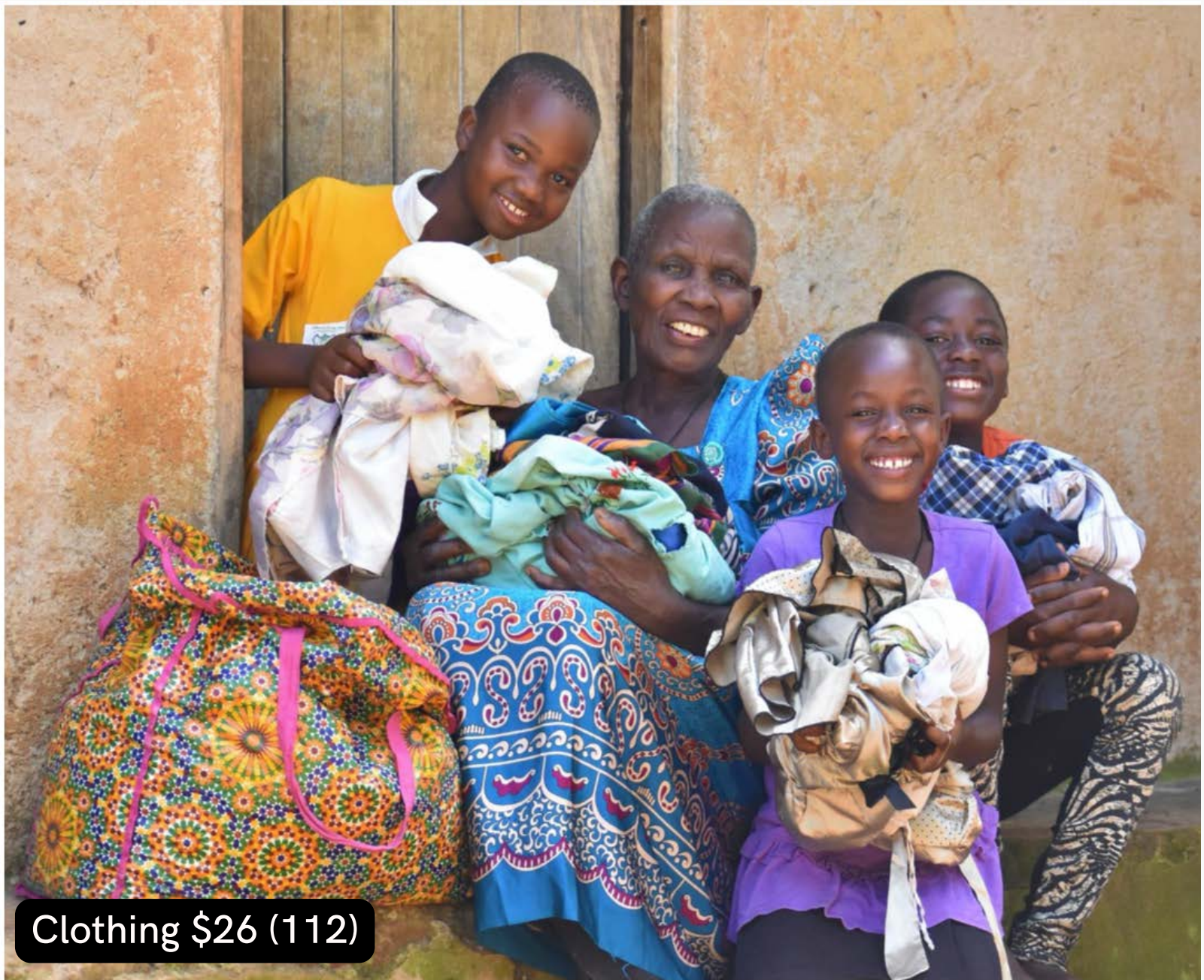
Clothing $26 (112)