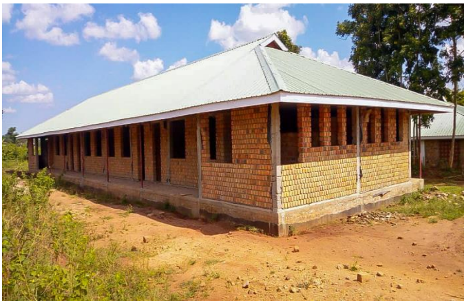
Above: The construction progress of the second four classroom block at The ROTOM School.

Our next big project for the school is construction of a school dormitory. The school dormitory will provide shelter to children whose grandparents have passed away and are in need of a safe place to enhance their well-being. The dormitory will provide an environment where children feel welcome, loved and encouraged to grow, and learn together.