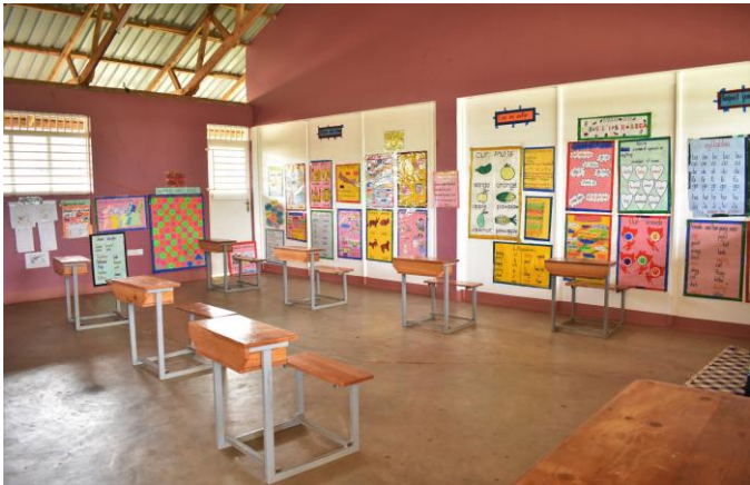
Left: The completed four classroom block at The ROTOM School. Right: Interior view of one of the classrooms at the ROTOM School